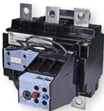
CES-RT4 250, 400