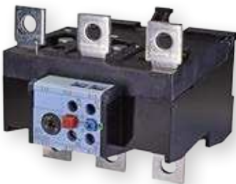
CES-RT4 160, 180