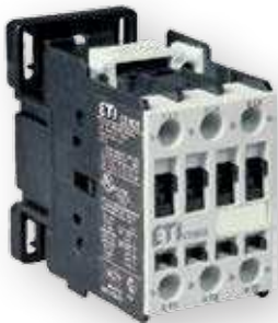
For auxiliary contact blocks, see page 212