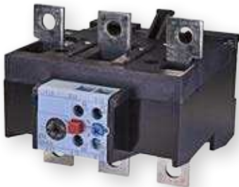
CES-RT4 120, 135, 150