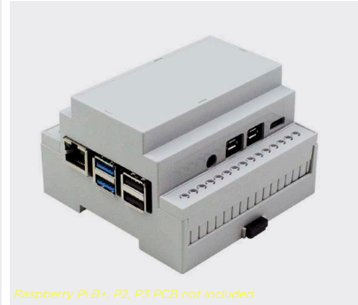
Raspberry Pi B+, P2, P3 PCB not included