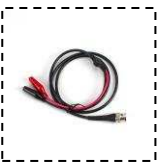
BNC plug to alligator clips cable