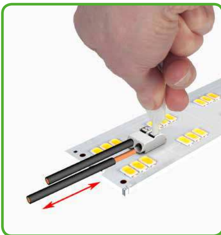
Inserting/removing fine-stranded conductors by lightly pressing on push-button.